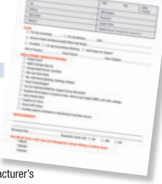
TABLE 2 - CARE PLAN

We continued to provide elements of the program that had already been in place including preoperative counseling and stoma marking, inpatient teaching, home health referrals, and patient enrollment in an ostomy